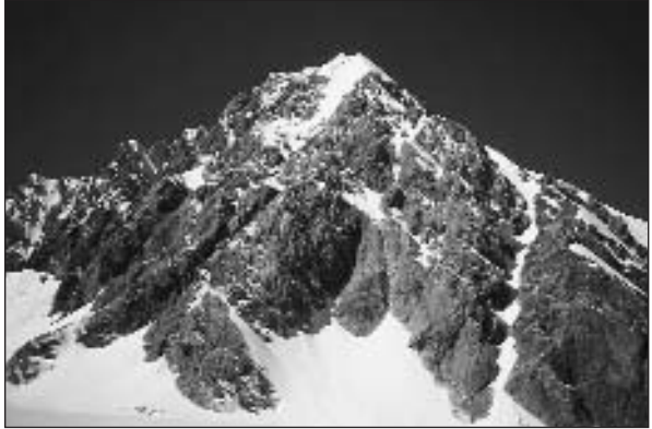
Pk Ilbirs (5,017m), climbed via the right-hand ridge.