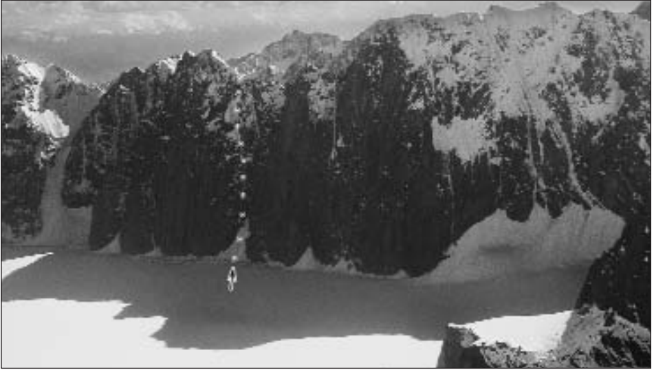
The first route on the Great Walls of China: Border Control (Robertson-Tresidder). Garth Willis